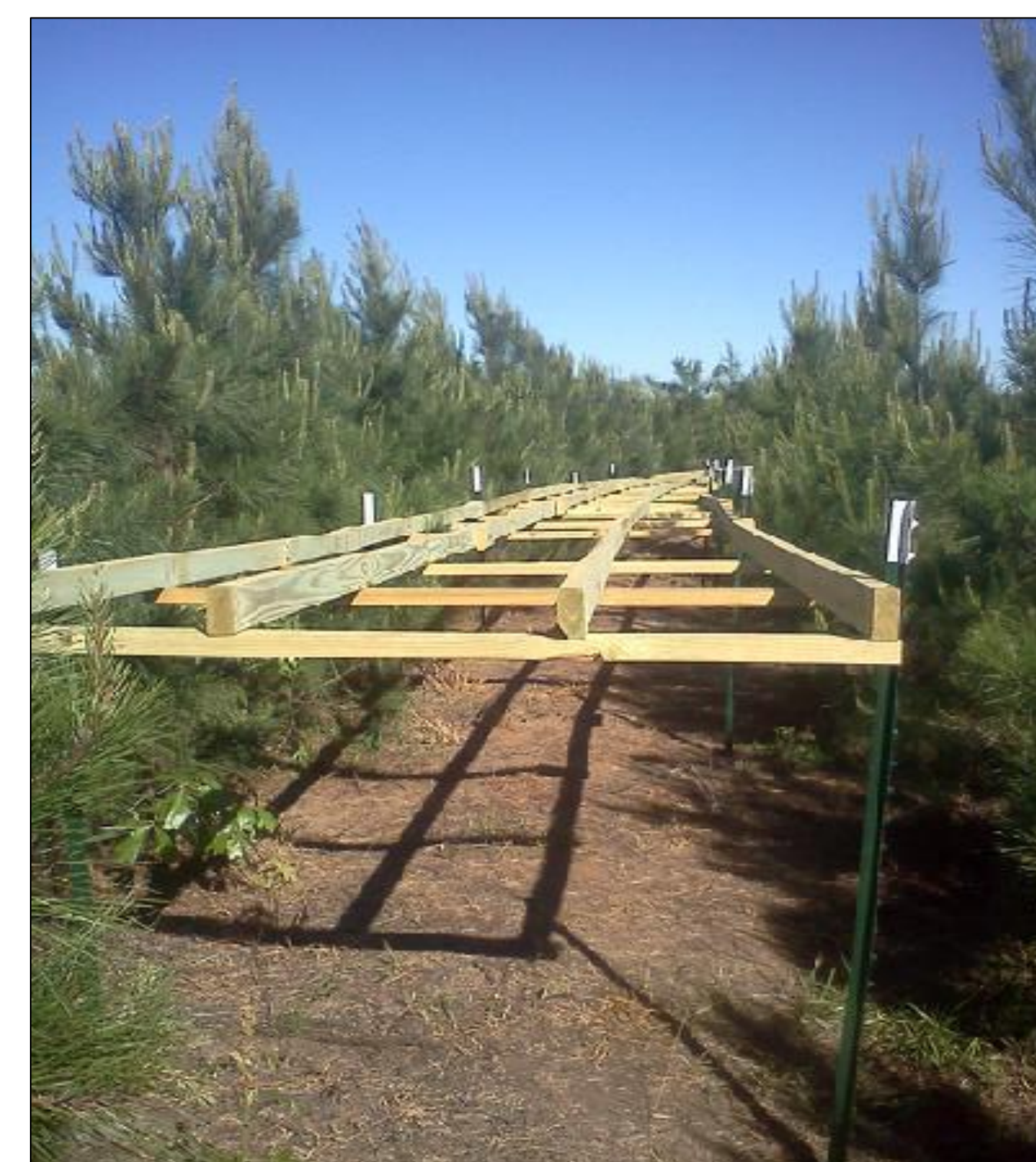
Rainfall exclusion treatment. Tier III site, Broken Bow, Oklahoma (McCurtain County)

The outcome of this proposed study will increase our understanding of how the benefits of nitrogen fertilizer are affected by water stressed conditions and how decreased water availability may alter nitrogen use in future forest management.