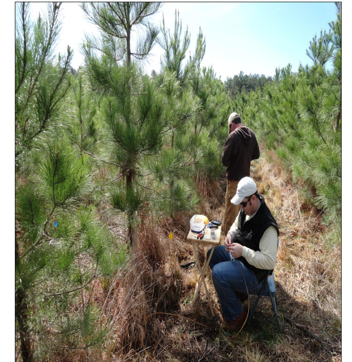
Soldering, part of the sap flow probe installation