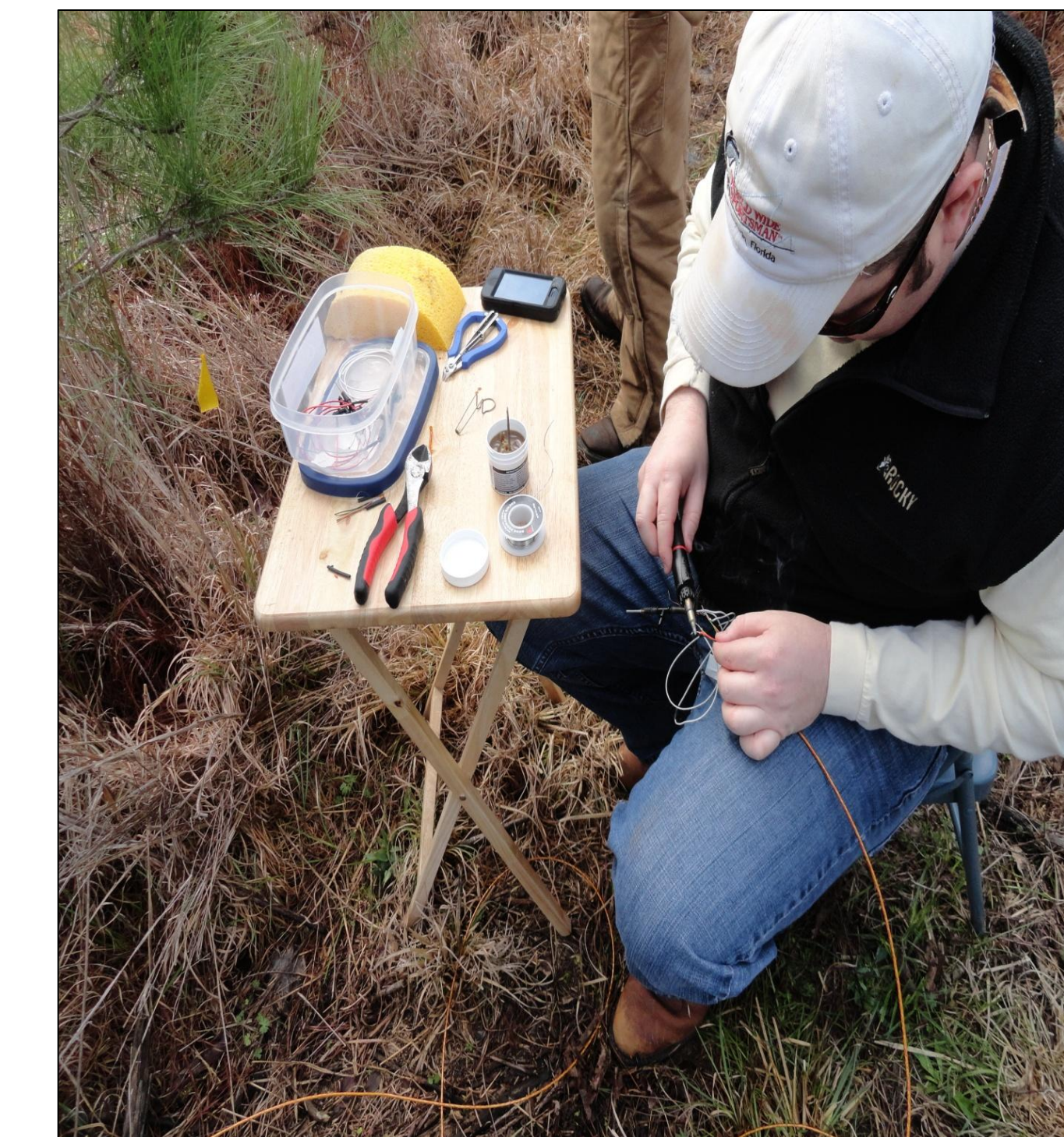
Soldering, part of the sap flow probe installation