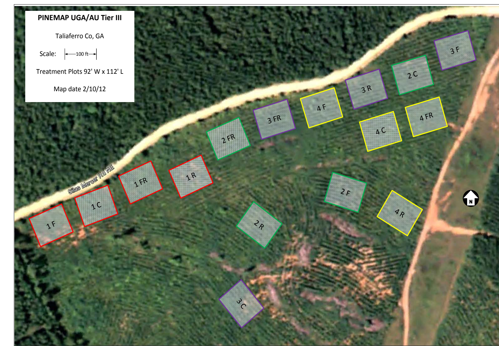
Fig. 1 Blocking map