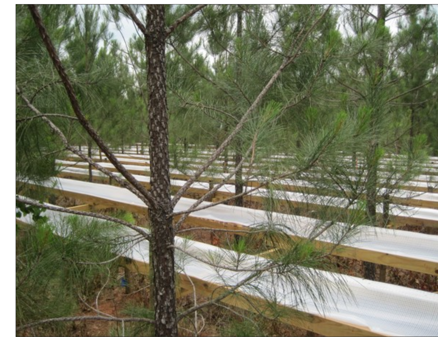
Fig. 2 Throughfall exclusion structure

Soils were sampled pre-treatment at 0-10, 10-20, 20-50, 50-100, 100-150, 150-200, 200-250 and 250-300 cm depths and will be sampled again in following years. These samples are also being incubated in sealed 1 L jars at field moisture capacity and 35°C to estimate CO 2 release. Gas samples for CO 2 were taken at 1, 2, 4, 7, 12 and 24 h. CO 2 concentration was analyzed with LI-COR 7000. Repeated wetting and drying cycles will be applied to these samples.