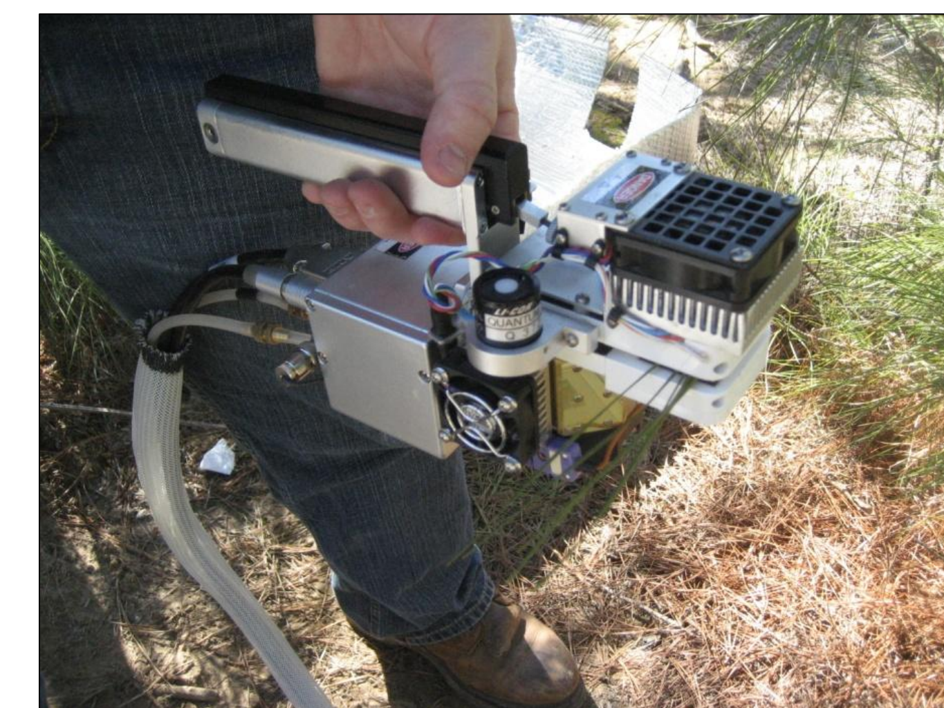
Figure 3. Measuring leaf gas exchange on the Tier III site in Oklahoma.