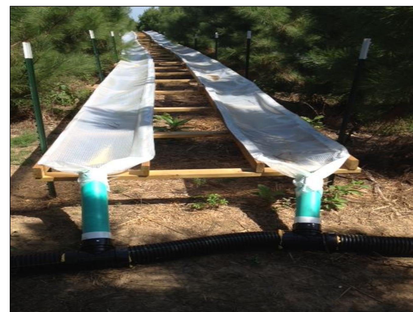
Figure 2. Rainfall reduction excluders on the Tier III site in Oklahoma.