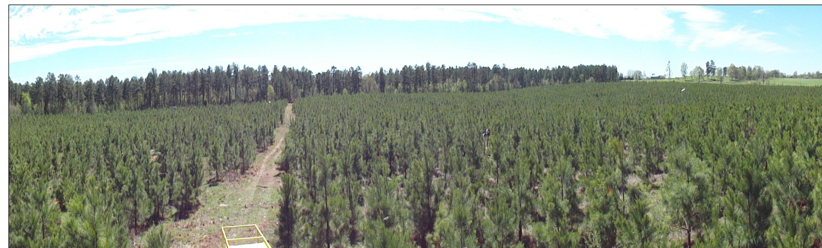
Figure 1. Tier III site in McCurtain county near Broken Bow, Oklahoma.

More specifically, the objective of this study is to determine if fertilizer provides enough benefits to overcome effects of decreased water availability in loblolly pine plantations or whether fertilization increases loblolly pines susceptibility to water stress.