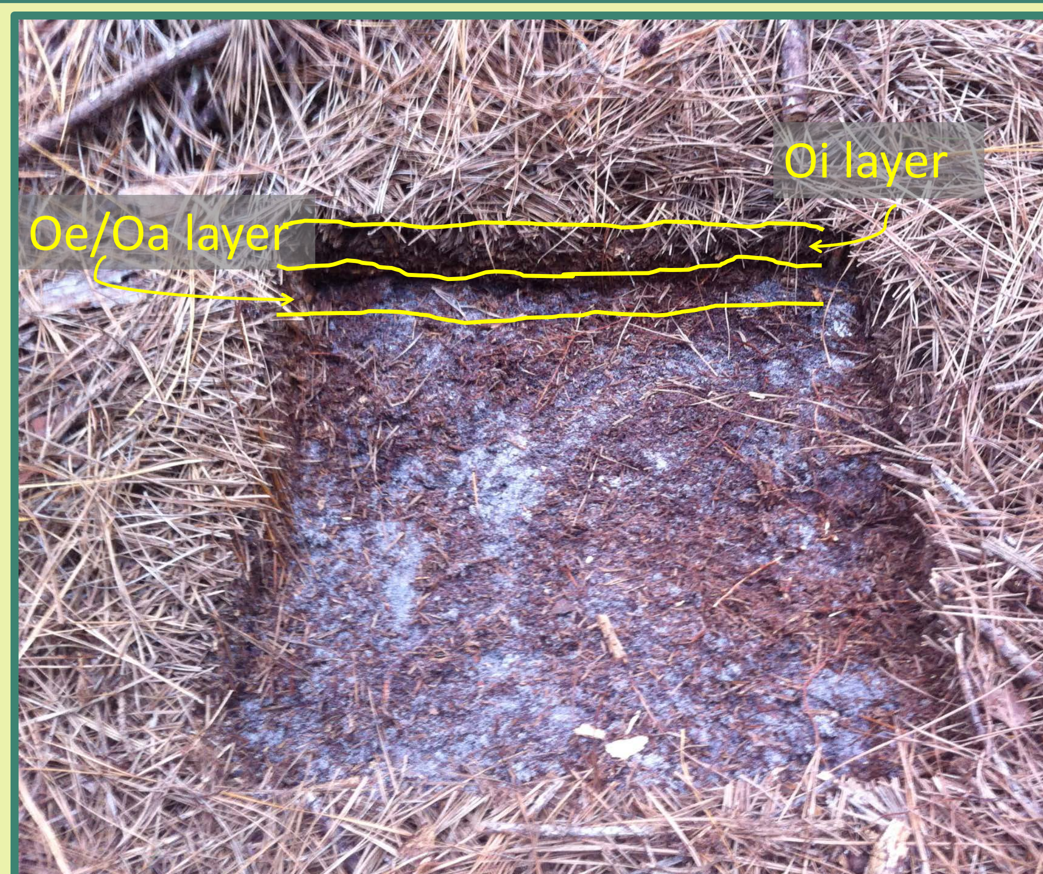
Figure 2. Forest floor after removal of the Oe/Oa layer (duff) and Oi layer (litter). Duff includes the dark, partly decomposed organic material (unrecognizable plant forms) above mineral soil. Litter is on top of duff and includes recognizable plant parts, such as leaves and flowers and twigs < 2.5 cm in diameter. This material is dried, weighed, ground, and analyzed for nutrient content.