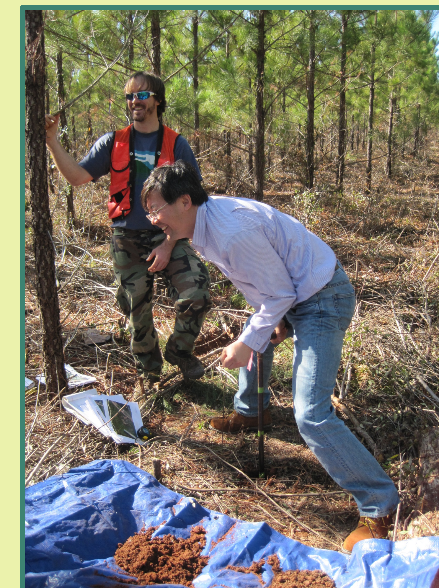
Figure 4. Use of a soil bucket auger to collect soil samples to a depth of one meter. Soils are placed by depth (0-10 cm, 10-20 cm, 20-50 cm, and 50-100 cm) on a tarp, homogenized, and then weighed. These samples can then be subsampled in the field and taken to the lab for processing to ultimately determine total carbon of the soil.