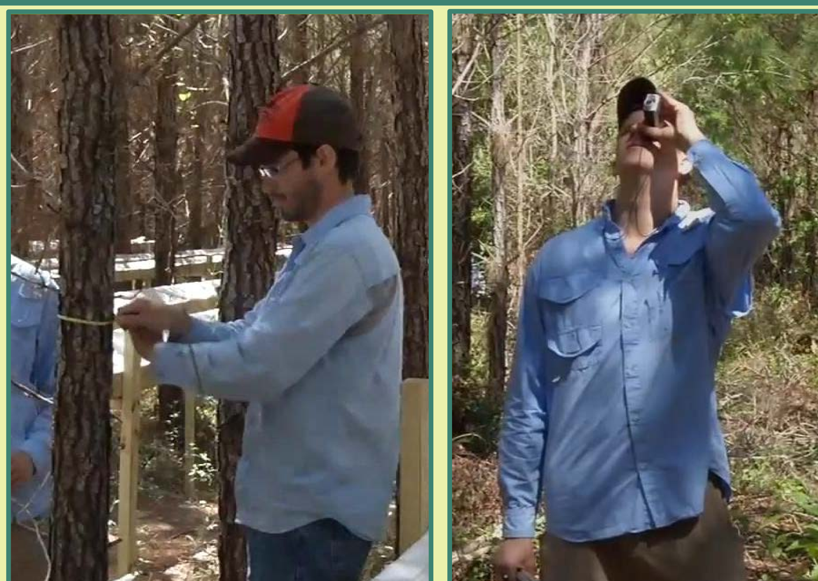
Figure 1. Measuring diameter (left) and height (right) on standing live and dead trees. These data are later used in models to estimate total tree volume and determine total carbon of standing stems.

Using standardized protocols, crews can sample the various above- and below-ground carbon pools including standing stems, soil, understory vegetation, forest floor, and coarse woody debris. The biomass and nutrient content data gathered from each of these components can then be scaled to estimate total ecosystem carbon.