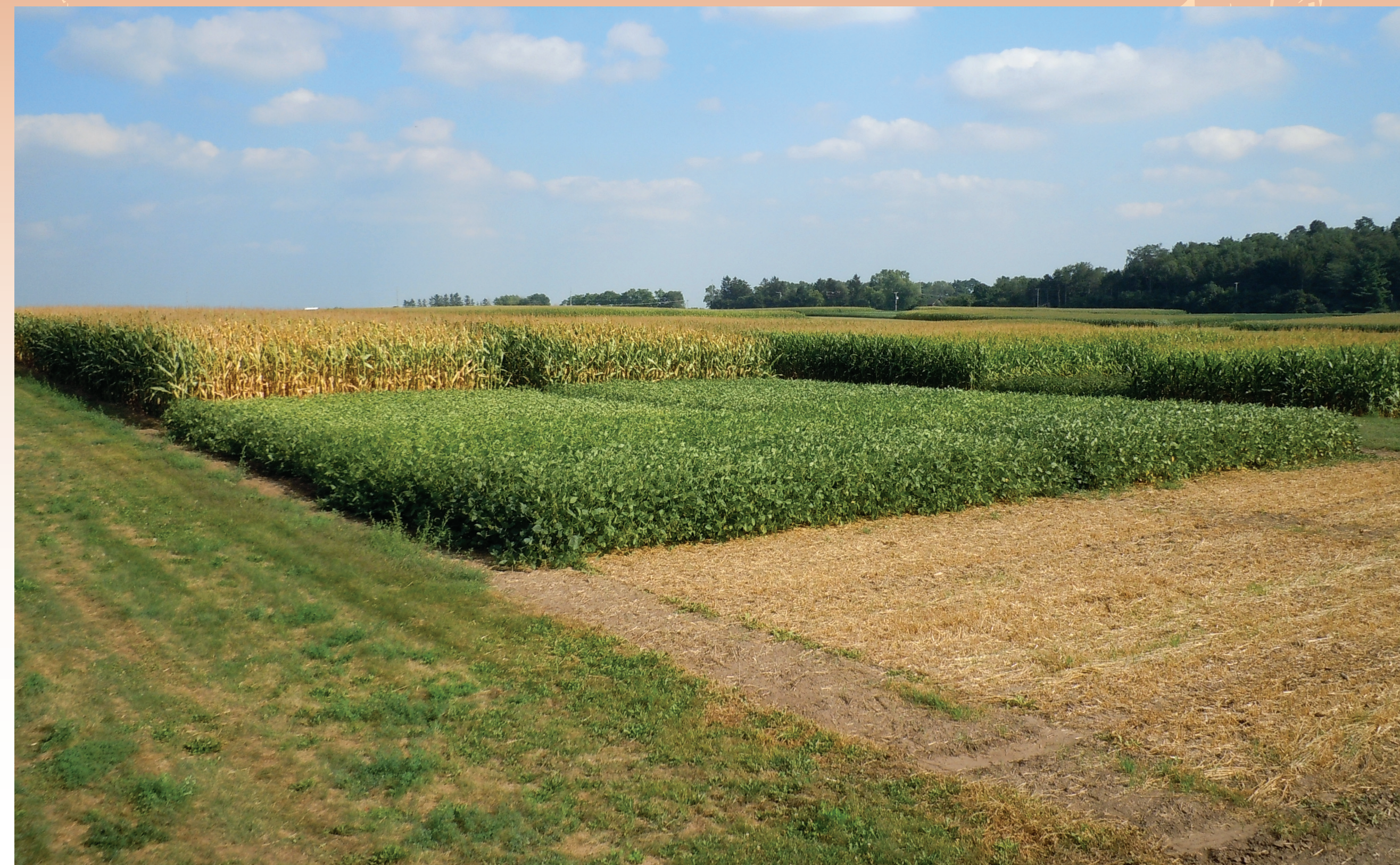
The University of Wisconsin's long-term rotation field sites at the Arlington Agricultural Research Station (above).